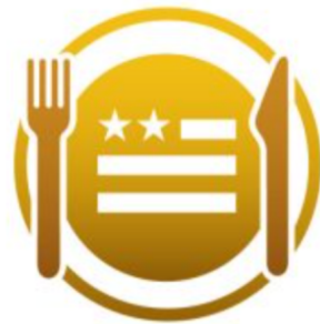
PLATE TO POLITICS

In March, for Women's History Month, we named 20 women who could be our next president in 2020.